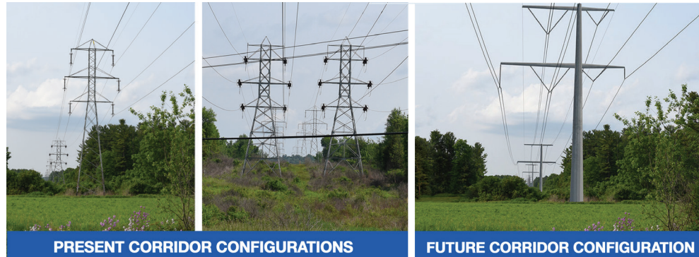
PRESENT CORRIDOR CONFIGURATIONS

Our New York Energy Solution project will advance New York's move to 100% emission-free energy by 2040 by delivering more renewable energy to businesses and homes.