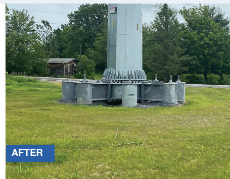
The photos above show how a new crop of corn is sprouting in an area where new monopoles were recently constructed, and provide an up-close look at restoration around a monopole foundation.

If you have questions about NYES, don't hesitate to reach out using the contact information below.